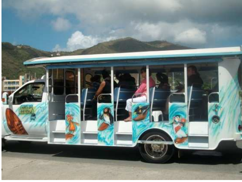
A bus in Tortola