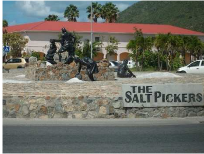
A school bus of St Martin

These statues of the Salt Pickers remind us of the economic past of the island based on salt.