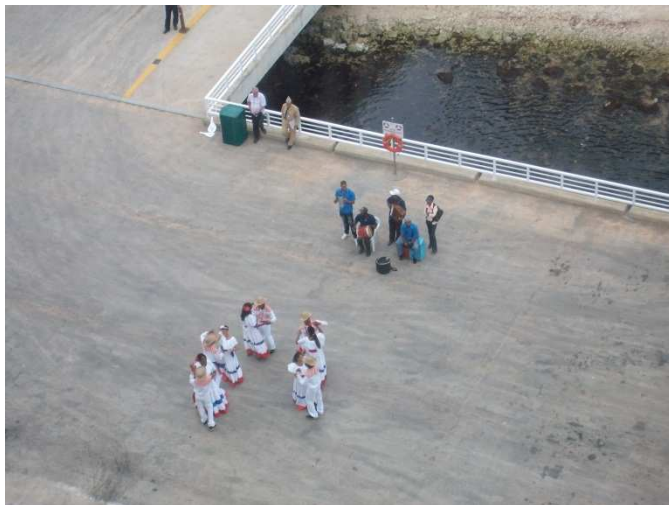
The salsa dancers welcome you in traditional outfit, like we did!